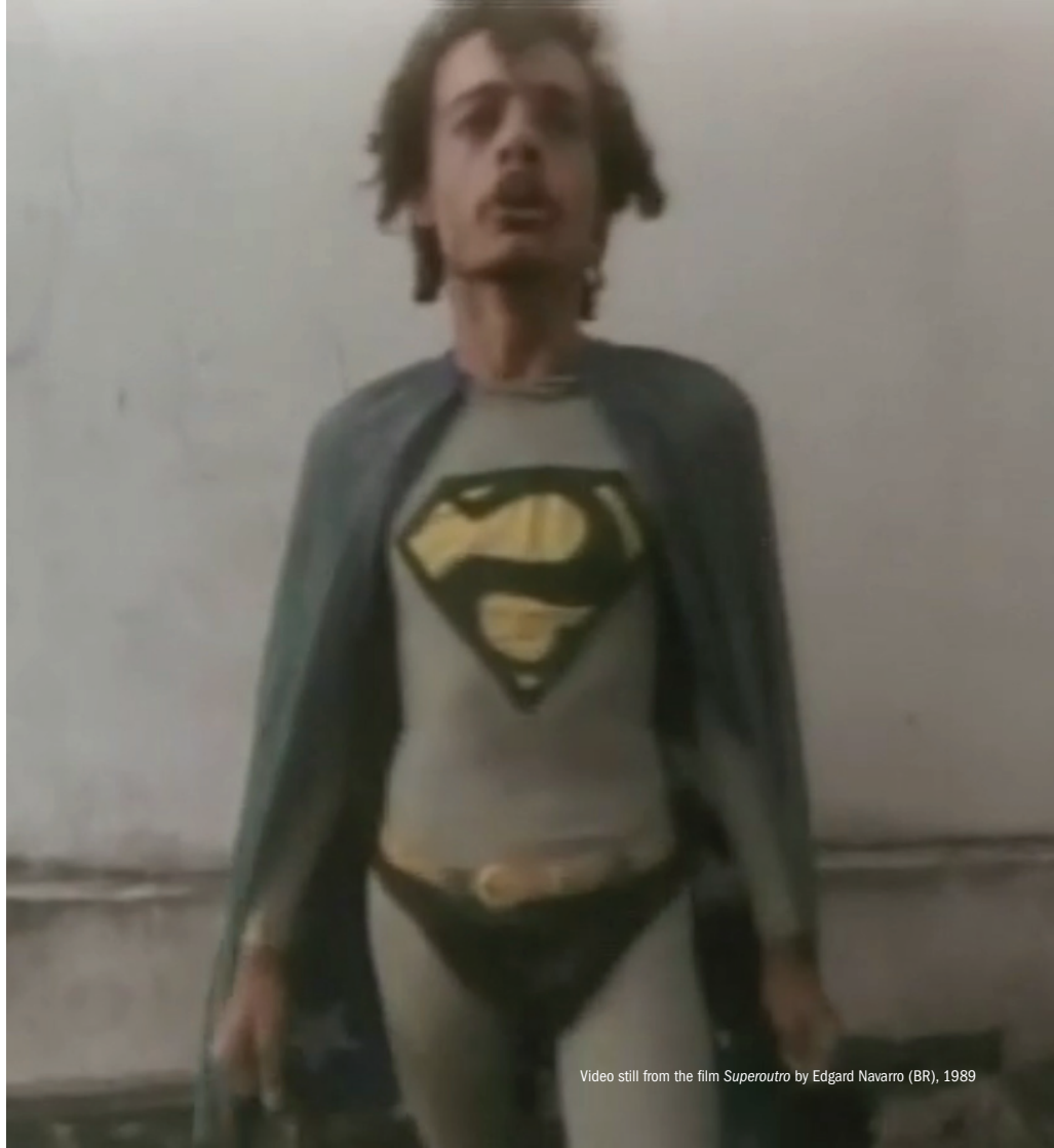
Video still from the film Superoutro by Edgard Navarro (BR), 1989

All panel discussions on Saturday, 28/05 will also be live broadcasted on / El panel de discusion del Sabado 28/05 será trasmitido en vivo en: Groovalizacion online radio at Groovalizacion.com