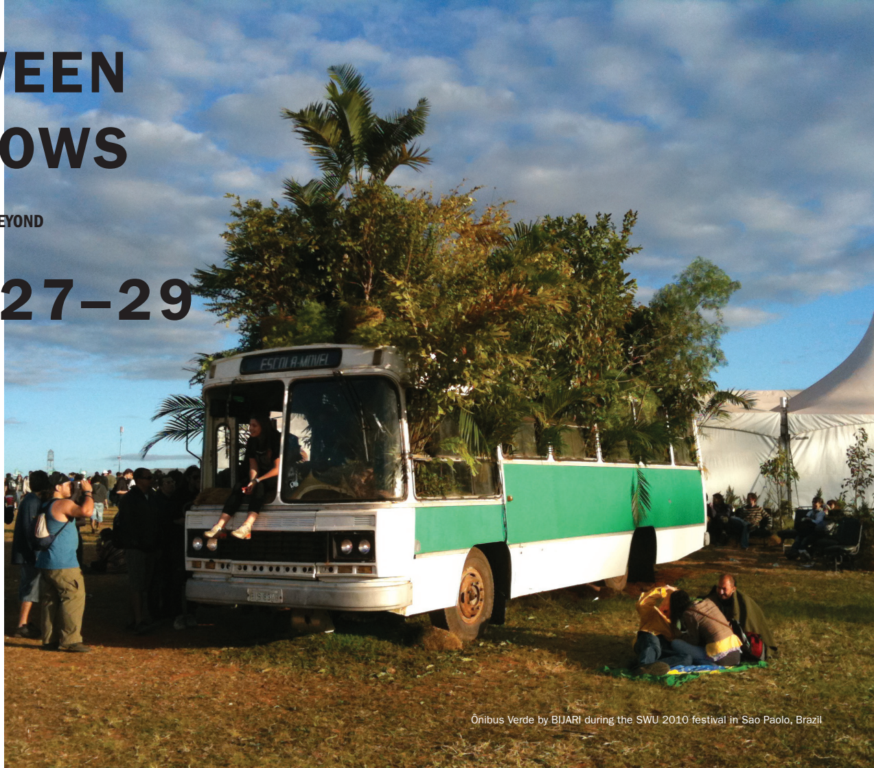
Ônibus Verde by BIJARI during the SWU 2010 festival in Sao Paolo, Brazil

AT THE MINDPIRATES Falckensteinstr. 48 1st Hof, Berlin